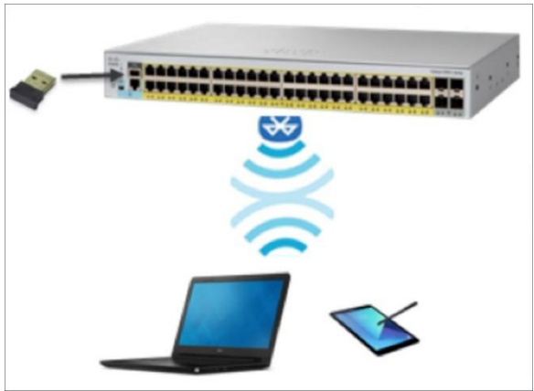
Figure 2. Over-the-air switch access using Bluetooth